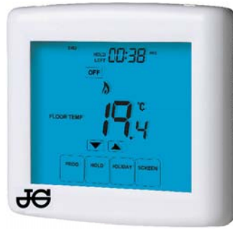
PROGRAMMABLE ROOM THERMOSTAT (UFH)