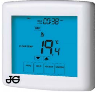
COMBINED HOTWATER & PROGRAMMABLE ROOM THERMOSTAT (Max 2 per Touchpad)